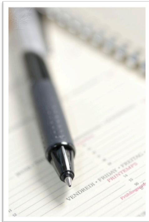
Daily Calendar and Pen. Photograph. Encyclopædia Britannica ImageQuest. Web. 1 Apr 2015. http://quest.eb.com/search/300_345527/1/300_345527/cite