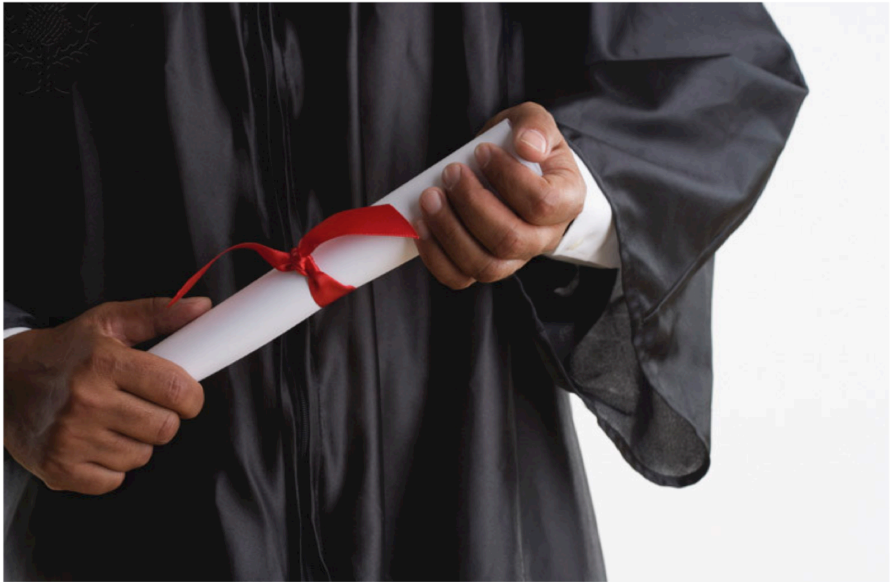
Mid section of man in graduation gown holding diploma.