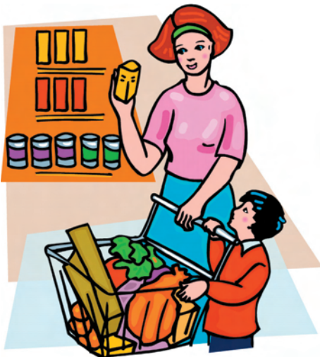
ir de compras